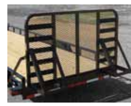
G08 - 5' HD Fold Gate w/Ramp & Springs