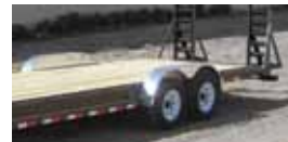
F08 - Diamond Plate Alum. Tear Drop Fenders (removable)