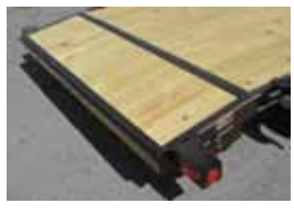
D01 - 2' Dove Tail