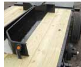
F06 - Diamond Plate Fenders (removable)