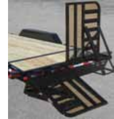
G11 - 6' HD Fold Gate Split w/Ramp & Springs