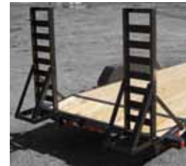
H03 - Fold Up Ramps 5' x 16" (carhauler)