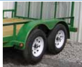
F03 - Smooth Plate Tear Drop Fenders (weld-on)