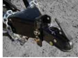
C07 - Coupler 2-5/16" Adjustable 4 Hole