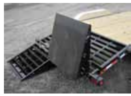
H08 - Multi Purpose Equipment Dove Assy