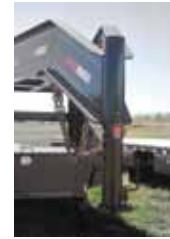
C14 - Gooseneck Coupler 2-5/16" Adjustable Rd.