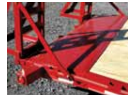
D02 - 2' Diamond Plate On Dove Tail