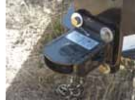
C09 - Coupler 2-5/16" Adjustable Flat Mount Turtle