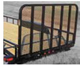
G06 - 4' HD Fold Gate w/Spring Assist