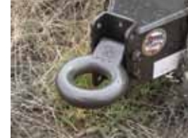
C11 - Pintle Ring 3" Adjustable