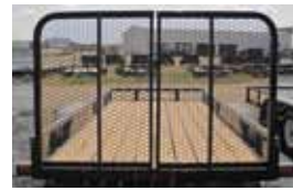
G05 - 4' Split Fold Gate Tubing w/Exp. Metal on 60"