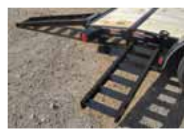
H02 - Slide-IN Ramps 5' x 13" (carhauler)