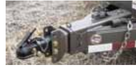
C08 - Coupler 2-5/16" Adjustable Hyd.