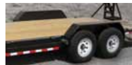
F05 - Diamond Plate Fenders (weld-on)