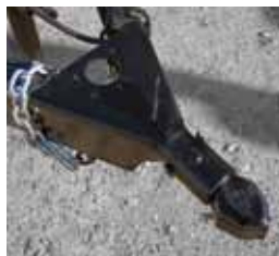
C01 - Coupler 2" A-Frame Cast