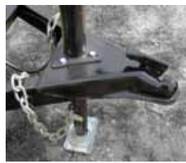
C06 - Coupler 2-5/16" A-Frame Stamped