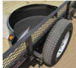
F02 - Smooth Plate Round Fenders (removable)