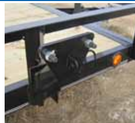
TM1 - Spare Tire Mount