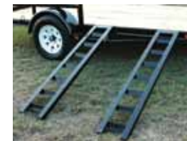
GS4 - Side Rail Ramps