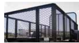
Q04 - Exp. Metal Sides 36"