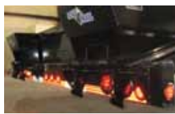
L03 - Lighting LED