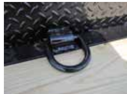
M02 - D-Rings 3" Weld On