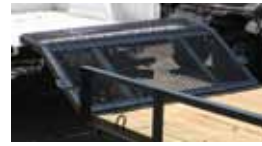
GF1 - Front Fold Gate