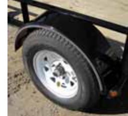
F01 - Smooth Plate Round Fenders (weld-on)