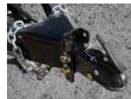
C07 - Coupler 2-5/16" Adjustable 4 Hole