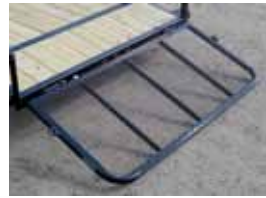
G03 - 3' Fold Gate Tubing w/Exp. Metal