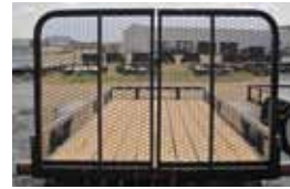
G05 - 4' Split Fold Gate Tubing w/Exp. Metal