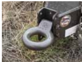
C11 - Pintle Ring 3" Adjustable 6 Hole