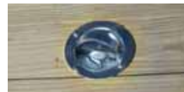
M04 - D-Rings 4" Recessed 360 Rotational Bolt On