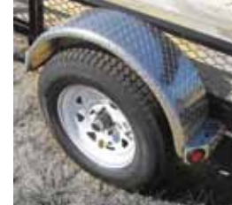
F07 - Diamond Plate Alum. Round Fenders (removable)