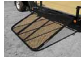
GS1 - 4' Side Fold Gate