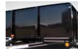
R04 - Solid Metal Sides 36"